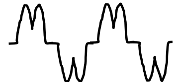
Typical current through LPF output stage

This stage is the first line of defense against harmonics and utilizes an optimum value of series impedance to reduce the magnitude of individual harmonic currents that are produced by a six pulse converter load, and also detunes the shunt stage to prevent a resonance conditions between the shunt stage and the load, and to minimize the peak current at the load terminals. During normal operation there will be a voltage drop across this stage, which increases as load current increases. The maximum voltage drop at the load terminals is maintained within 5% of the input voltage at full load operating conditions. The waveform, as measured in this stage, looks very similar to that which is measured at the input terminals for a 6-pulse rectifier with line reactor of approximately five percent impedance.